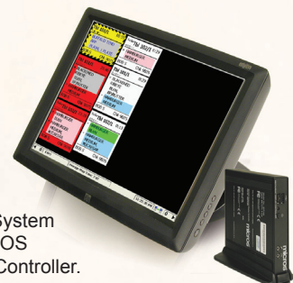
Kitchen Display System with the MICROS Restaurant Display Controller.