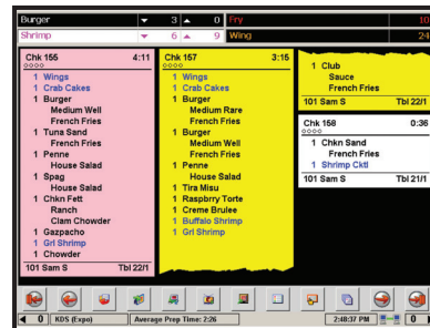
KDS (Expo) Display using the standard chit layout with production items