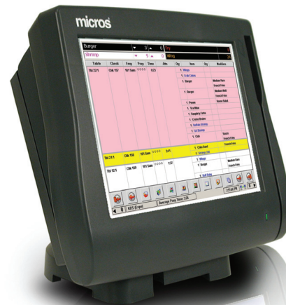
KDS (Expo) Display using the standard list mode with production items.