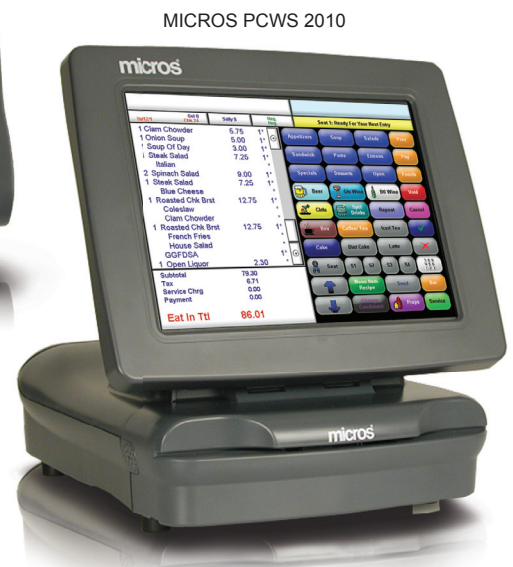
MICROS PCWS 2010